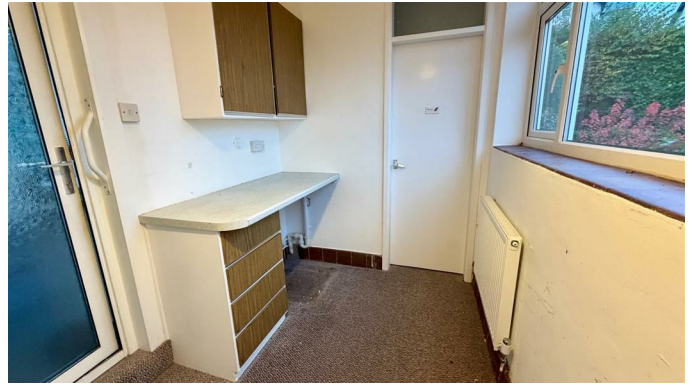
UTILITY ROOM 7'10" x 6'2" (2.41m x 1.89m)

Wall mounted units, drawers and worktop, plumbing for automatic washing machine, radiator, upvc double glazed window, side access door leads to the front and integral door to garage.