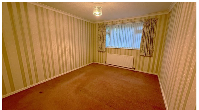
BEDROOM 2 13'10" x 11'0" (4.24m x 3.36m)

Coving, radiator, upvc double glazed window to rear.