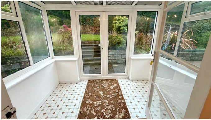
CONSERVATORY 8'9" x 6'8" (2.69m x 2.04m)

Two wall light points, upvc double glazed windows with opening lights, double opening upvc double glazed doors to rear garden.