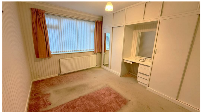
BEDROOM 1 11'11" x 10'11" (3.64m x 3.33m)

Including built in double wardrobes, dressing table and top cupboards, coving, radiator, upvc double glazed window to front.