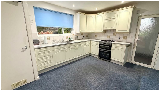
KITCHEN/ BREAKFAST ROOM 13'1" x 10'9" (4.00m x 3.29m)

Two wall light points, upvc double glazed windows with opening lights, double opening upvc double glazed doors to rear garden.